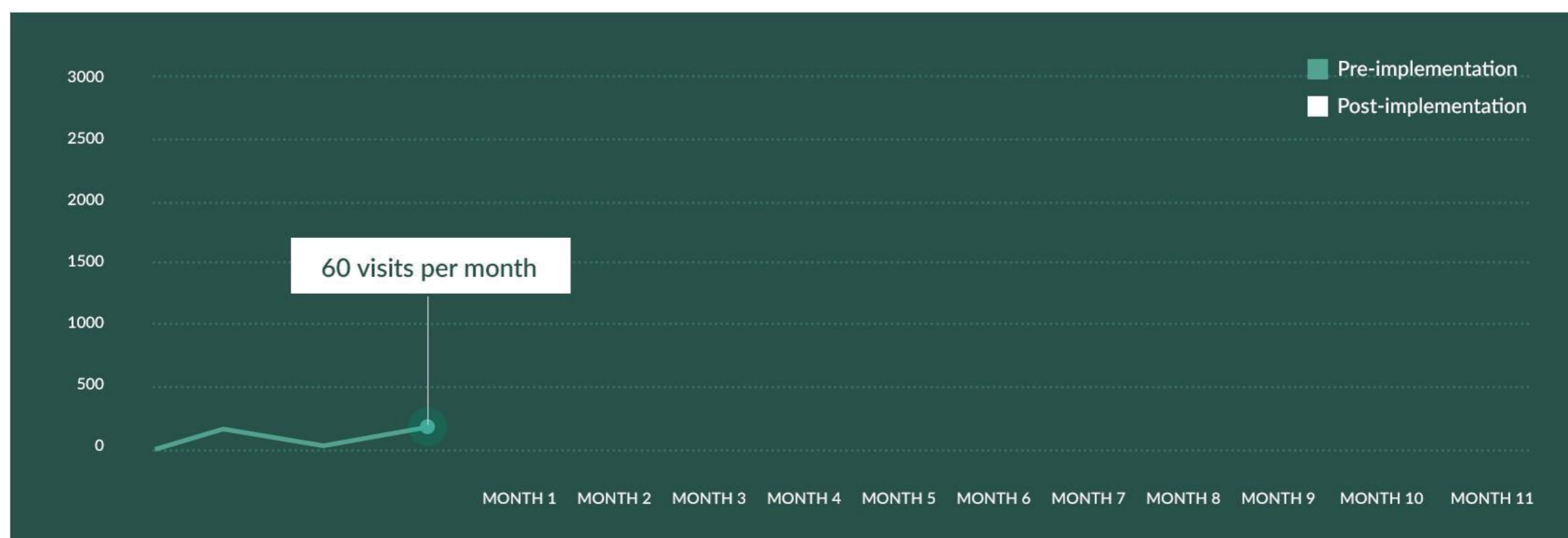
1.1 Image showing an average of 60 visits per month prior to working with us.

Although the client already had a website for several years prior to working with our agency, it wasn't creating the impact on their business they knew it could. Traffic was appallingly low, generating an average of 60 visits a month, and rarely generating any actual sales.